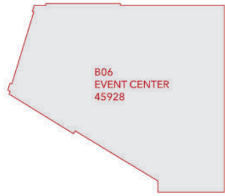
UNIT B06 | 45,928 SF